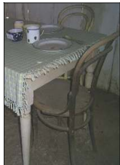
Wooden table and chairs