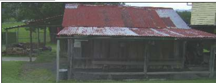
These exhibits shown above are placed in Bungawatta Hut