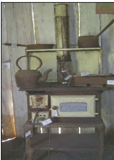
Crown Dover Wood Stove

And now in their twilight years Both pensioners and hut alike, Can show the young ones hope, not fears As their future comes in sight.