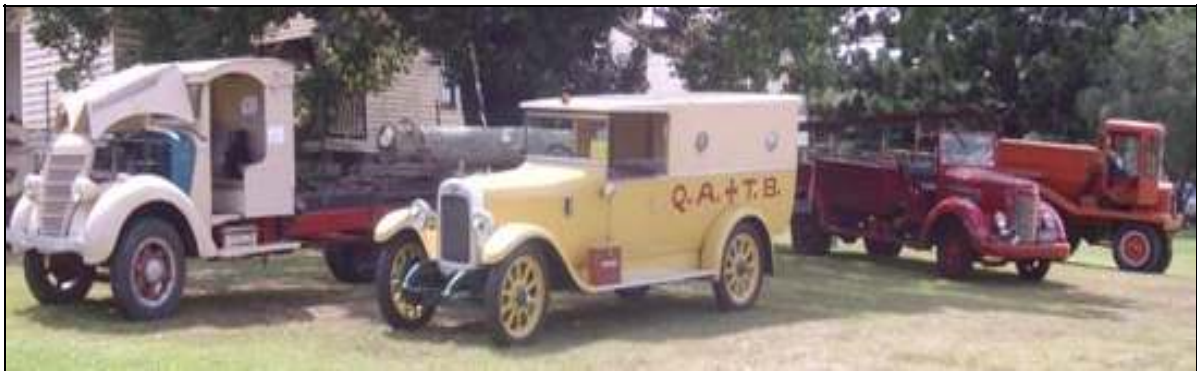
The 1938 International Truck , 1924 Austin 20, 1942 International Fire Engine, and the 1950 Aveling Barford Dump Truck were proudly displayed.