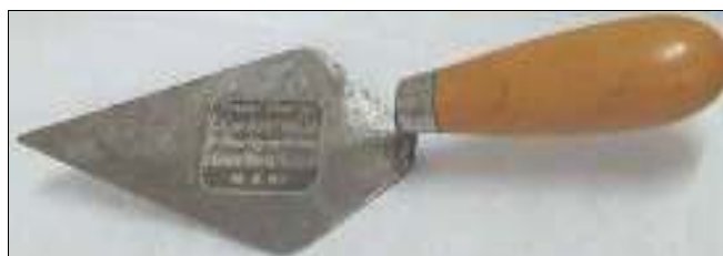
The wooden handled trowel mentioned can be viewed in a display case in the Tank

Info. from Gympie Times 19 September 1967