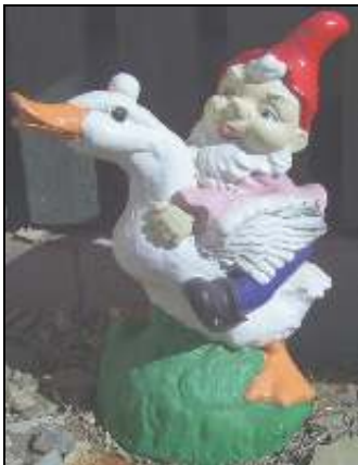
Feeling right at home (outside the Cottage) with other members of the family

It was a pleasure to have known him. Ed.]