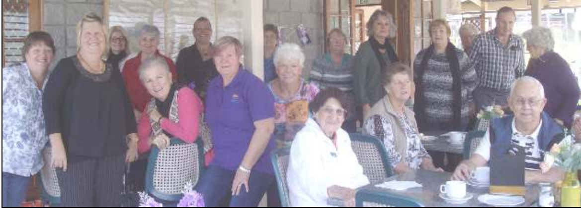
'Supporting Chemotherapy in Cooloola' group who dined at the Café for morning tea and lunch in early June

Early morning Breakfasts were popular during the month with a meeting of the Monkland State School teachers, and on another occasion a Pastors group also chose the Café venue.