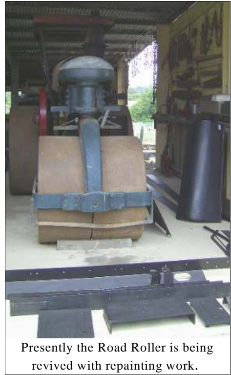
Presently the Road Roller is being revived with repainting work.