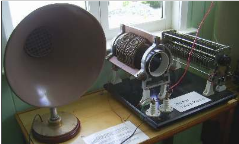
Wired for sound!

There is no battery or other power source required.